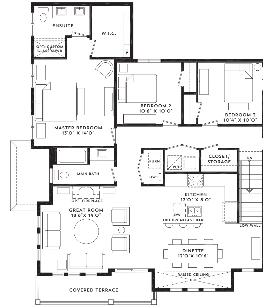
▶ SECOND FLOOR